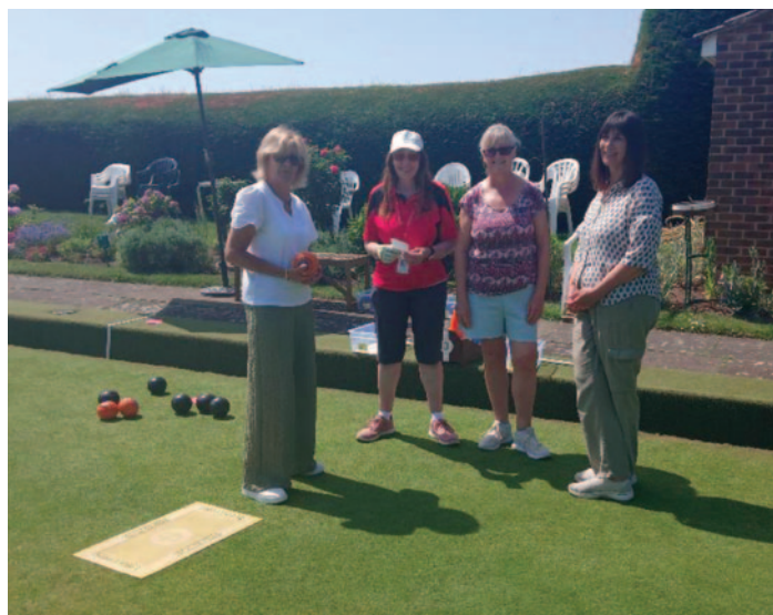
Photograph shows one of our open days with people trying their hand at bowls.