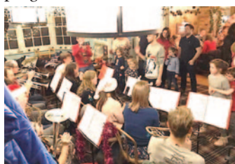
Builders Arms party night.

Our senior Showband has retained most of our 55 players and will be working on their new programme for competitions and events coming up soon hopefully. Music selected for this specific programme is the theme music from 'The Incredibles', 'Take on Me'