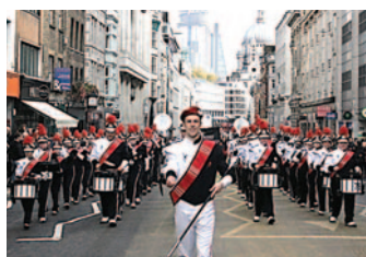
Lord Mayor's Show.

Now is a good time to join our band. We do know we have 3 new seniors joining when we start back. If you got up to a good standard in the past, then why not dust off the instrument and come along to 'try us out'. Core age of the senior band is 16 to 40, with playing ability from around Grade 5 level to graduate. We have spare brass instrument free on loan.