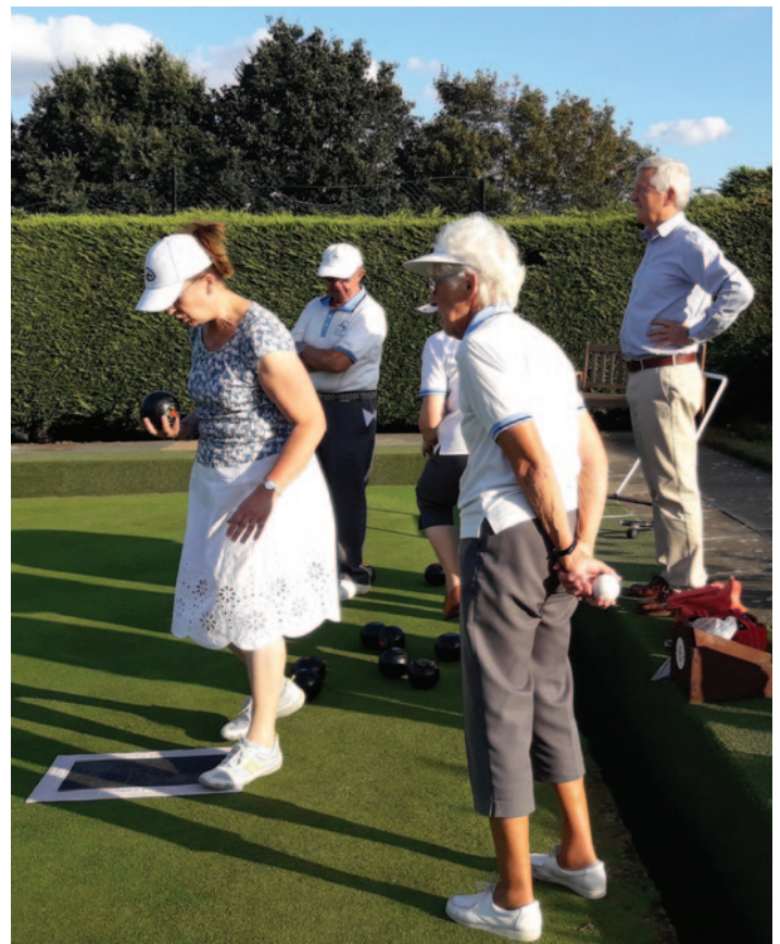
'Have a Go' day at the club – some people trying out bowling for the first time.